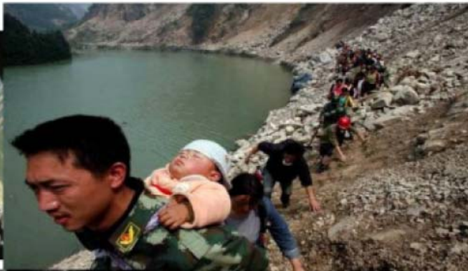
the quake-afflicted people were facing great difficulties