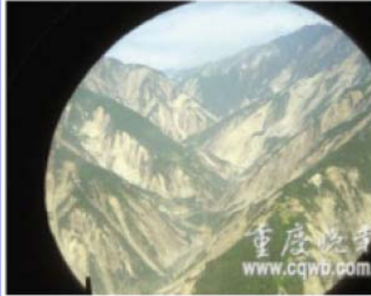
A bird's-eye view of the affected area